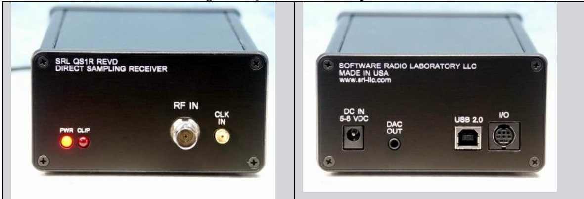
Figure 1: QS1R front & rear panel.

Introduction: This test report presents results of a number of RF lab tests performed on a QS1R Rev. D direct-sampling SDR receiver obtained on loan.